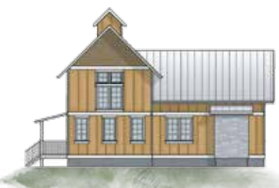
Left side elevation

150 s.f. of deck or patio Extra deck, patio or wraparound deck is additional cost.