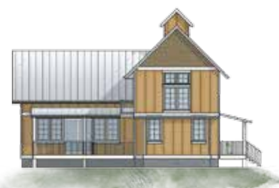
Right side elevation