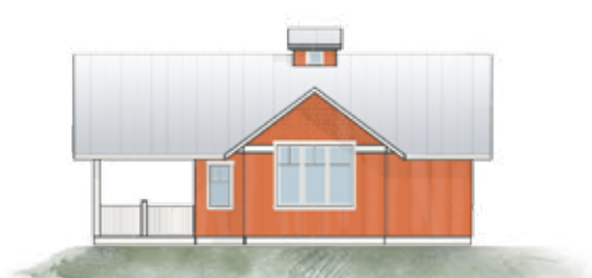
Right side elevation