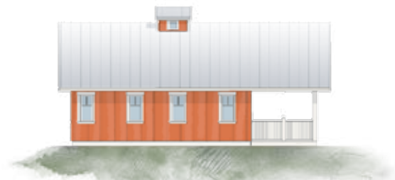
Left side elevation