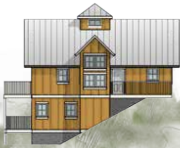
Right side elevation