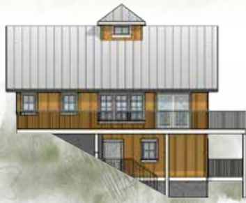
Left side elevation