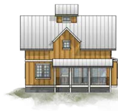
Left side elevation