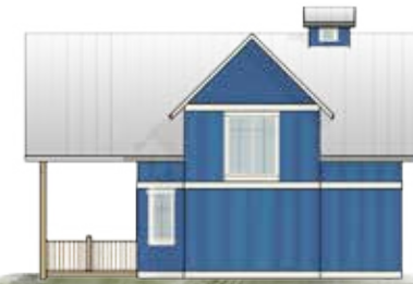
Right side elevation