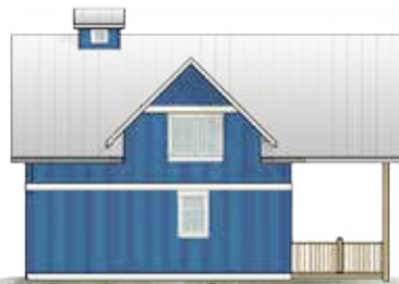
Left side elevation