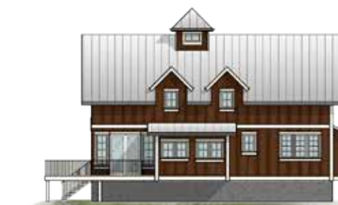
Right side elevation